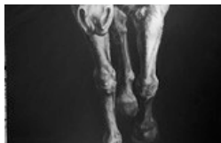
Lyna Evans "Coming Home," Charcoal/paper, 45"x33"