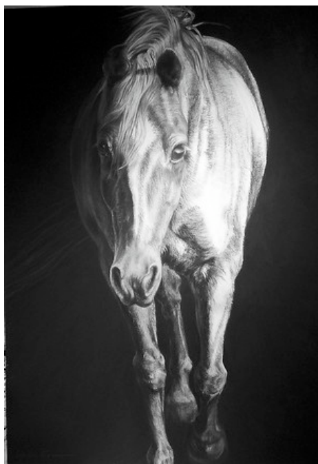
Lyna Evans "Coming Home," Charcoal/paper, 45"x33"

Horses are the stars. But the pregnant donkey is worth a look, too.